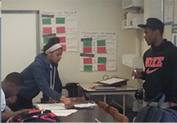
Tutee turned tutor: Helping his fellow classmates